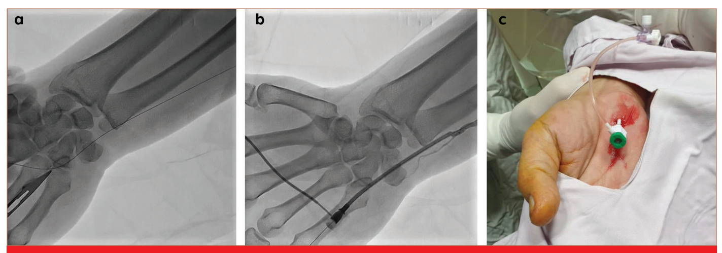
Figure 2. Angiographic depiction of the trans-palmar access (a, b) and cannulation of the distal ulnar artery (palmar artery) (c)

qualitative variables were expressed as number (percentage). The data were in normal distribution; therefore, the variable t test was used to compare the means of continuous variables, and the chi-squared test was used for categorical data. The Friedman test was used to compare the mean VAS measures between the groups. A two-tailed p value <0.050 was considered statistically significant.