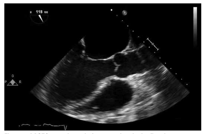
Figure 2. LASEC was absent before grasping the leaflets in case 1

severe MR and informed consent was obtained. During the Mitraclip procedure, the patient developed AF but recovered in the end of the procedure. MR was reduced from 4+ to 1+ and mean transmitral gradient was 2 mm Hg. His ACT was 260 seconds at the time of device deployment.