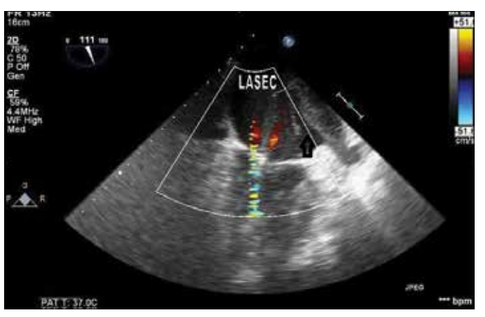
Figure 1. Transesophageal echocardiography demonstrates trace residual MR and marked LASEC (marked with arrow) after grasping the leaflets in case 1

The second patient was a 43-year-old man with a LV EF of 15%. His medical history included paroxysmal AF. TEE demonstrated severe MR at A2-P2. He was selected to have percutaneous mitral valve repair with the MitraClip system due to his unsuitability for heart transplantation. The patient and his family were offered percutaneous repair of