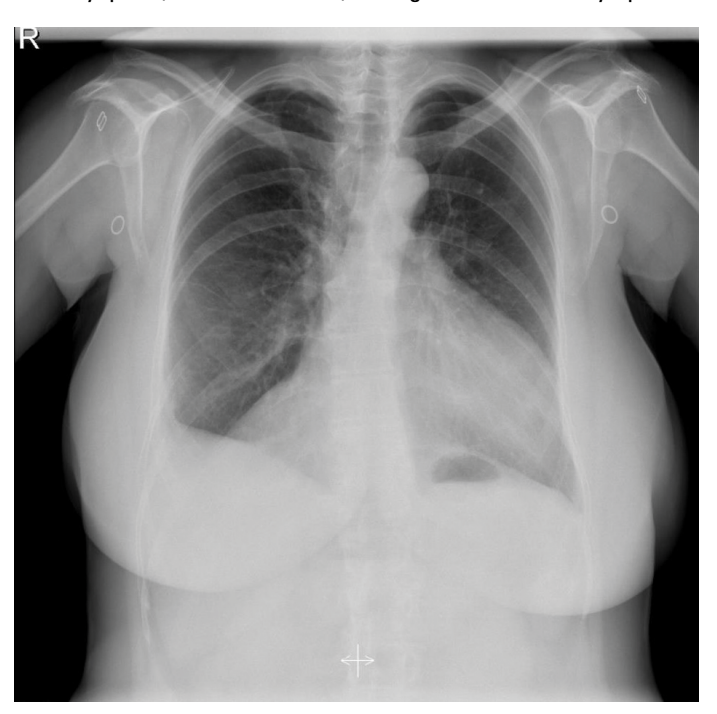
Figure 1. Chest radiography (anteroposterior) showing an elevated rightsided hemidiaphragm

In most cases, diaphragmatic eventration is asymptomatic, with incidental discovery on chest radiography or may present with dyspnea, chest infection, and gastrointestinal symptoms.