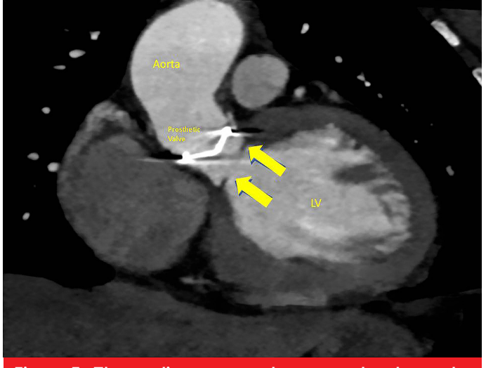
Figure 3. The cardiac computed tomography shows the subaortic membrane (arrows) in left ventricular outflow tract. LV, left ventricle.