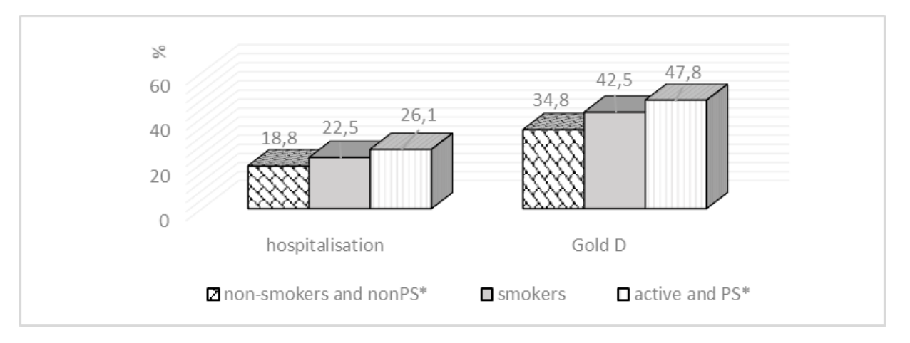
Figure 2. Active and passive smoking exposure rates in hospital admissions and GOLD D COPD patients

The passive exposure of current smokers in the study group was 57.50%. Hospital admissions in the last year were higher (26.08%) among current smokers with passive exposure. In the study, the GOLD D class patients rate was 47.82%. (Figure 2).