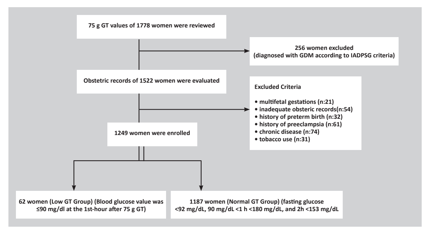
Figure 1. Flow diagram of groups.

the study, 62 (4.9%) had low glycemic value (1st hour blood glucose <90 mg/dl).