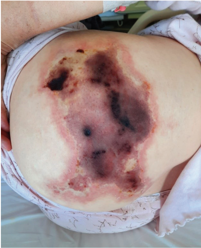
Figure 1. Large, erythematous plaque with necrotic and livedoid areas on it, surrounded by an erythematous ring, and hard compared to the surrounding tissue.

plaques and ulcers. Common causative agents include NSAIDs, etanercept, and antibacterial agents. The gluteal region is most frequently affected, but cases have been reported involving the thigh, knee, and ankle (1). The patient in our case study developed symptoms after an intramuscular injection of diclofenac sodium.