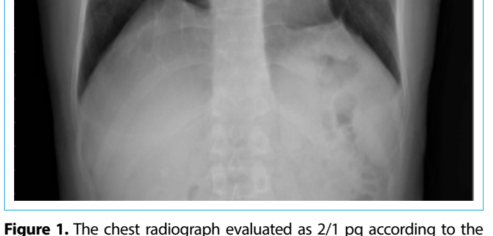
Figure 1. The chest radiograph evaluated as 2/1 pq according to the International Labour Organization International Classification of Radiographs of Pneumoconioses.

Aluminum-associated lung diseases are very now rare in occupational medicine. The first cases of lung disease due to industrial exposure to aluminum were reported in Germany in the 1930s.<sup>[4]</sup> The impact of aluminum dust inhalation on the lungs was comprehensively studied in the 1940s, when Goralewski first used the term "aluminum lung".<sup>[5]</sup> He explored several pathophysiological mechanisms and