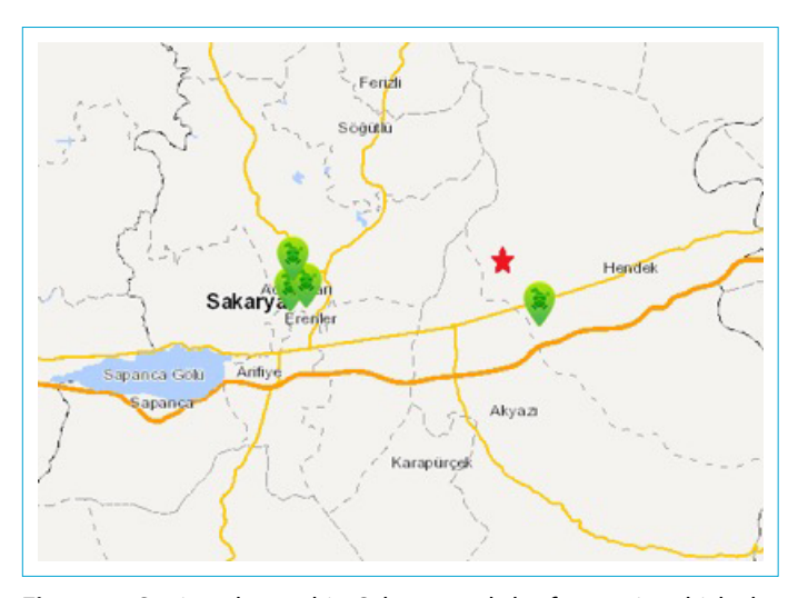
Figure 1. Stations located in Sakarya and the factory in which the explosion occurred.

The PM2.5 value showed an increase of as much as 50.4% before the explosion which was statistically significant (p=0.010). Similarly, a statistically significant increase of 42.4% was shown when the SO<sub>2</sub> situation changed after the explosion (p=0.010). The relationship between exposure before and after air quality parameters change is summarized in Table 1. The maximum NO<sub>x</sub> measurement value measured before and after the explosion were 82.2 \mu g/m<sup>3</sup> and 110.9 \mu g/m<sup>3</sup>, respectively. An increase of 24.5% (7.71 \mu g/m<sup>3</sup>) was observed in the O<sub>3</sub> median value after the explosion when the O<sub>3</sub> change was evaluated before and after