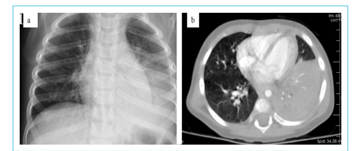
Figure 2. The chest imagings of the case 2. (a) Lobar consolidation and pleural effusion in the left lower lobe in the chest X-ray. (b) Patchy nodular consolidations with peripheral ground-glass opacities in the subpleural areas of the right lower lobe and lobar consolidations with minimal pleural effusion of the left lower lobe in the chest computed tomography.

planin, cefotaxime, oseltamivir and azithromycin treatment were initiated with oxygen support. Although the respiratory virus panel was negative for RSV and influenza, RT-PCR for SARS-CoV-2 was positive. Chloroquine was added to her treatment after the positive results for SARS-CoV-2. Teicoplanin was discontinued because the blood culture that was taken on the first day of hospitalization showed penicillin-sensitive Streptococcal pneumoniae. The patient showed good clinical and radiologic improvement and became afebrile on the fourth day of treatment in the followup period. Oseltamivir was discontinued on the fifth day of therapy because the respiratory virus panel was negative for influenza. The need for oxygen support disappeared and chloroquine treatment was completed to five days following the recommendations of the current guidelines of the Turkish Ministry of Health. The patient was discharged with oral antibiotic therapy on day 10 of admission.