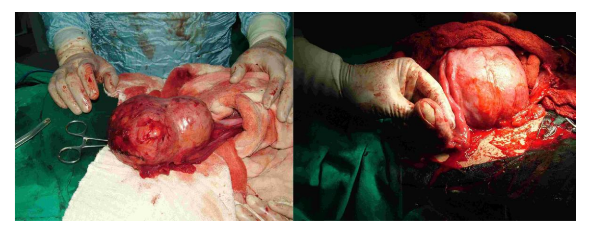
Figure 2. Perioperative clinical appearance of bilateral dermoid cysts