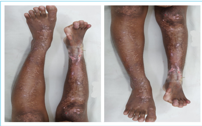
Figure 1. Multiple depigmented sclerotic plaques with old atrophic scars, post-inflammatory hypopigmentation over both legs, hyperextension of right metatarsophalangeal joint with complete nail dystrophy, single tense bullae and erosion with crusting over the right leg.

prevent trauma and friction, like wearing well-fitting footwear, leather shoes with lining and wearing two pairs of socks.