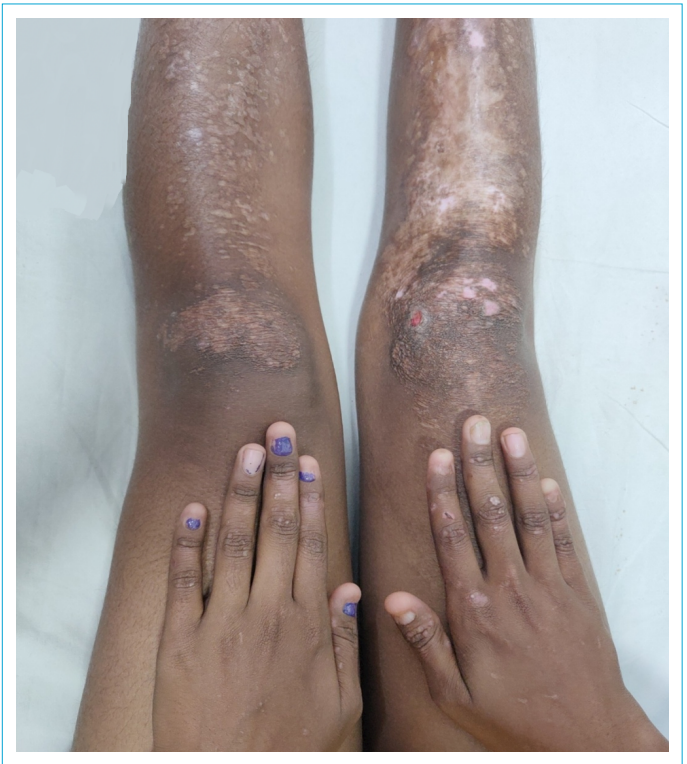
Figure 2. Nail dystrophy of left hand sparing left ring finger.

DEB can be autosomal recessive or dominant, and irrespective of genotype, it results from a mutation in a single gene, COL7A1, located in chromosome 3 (3p21.1), which encodes Type VII collagen, which is the major component of anchoring fibril structures beneath the lamina densa. [1] Dominant DEB is subdivided into six subtypes: generalized, acral, pretibial, pruriginous, nails only and bullous dermolysis of newborns. This rare pretibial variant of DEB was first described by Kuske in 1946, and it has a prevalence of <1/10.00.000. It is distinguished from other forms by milder phenotype, more localized lesions with blisters and erosions, scarring, milia formation with frequent pruritus and nail dystrophy. Apart from histology, the level of blister formation can be determined using antigen immunomapping, which shows deposition of fluorescence on the roof of the blister (epidermal side) with the presence of four main antibodies against collagen Type IV, bullous pemphigoid antigen, laminin, collagen Type VII demonstrating cleavage in sublamina densa. Unfortunately, there is no effective treatment for epidermolysis bullosa. [2] The mainstay of treatment includes the prevention of trauma and local wound care. Cyclosporine, thalidomide, and topical tacrolimus can be given in cases with refractory pruritus. Recent advances in the treatment of epidermolysis bullosa, including Gene therapy, protein replacement therapy, and cell-