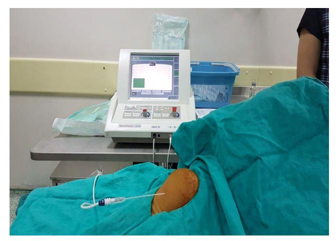
Figure 3. Conventional radiofrequency ablation application to calcaneal spur.

plying 2% lidocaine under the skin. A 10 cm long 22G radiofrequency cannula with a 5 mm active tip (Neuro-Therm<sup>®</sup>, Radionics, Burlington, MA, USA) was passed, until the tip reached the heel spur and was placed on three points - at the top, above, and below the heel spur in the longitudinal plane of the foot. A radiofrequency thermocouple electrode (NeuroTherm®, Radionics, Burlington, MA, USA) was passed through the radiofrequency cannula. A 10 cm long, 23 Fr radiofrequency cannula with a 5 mm active tip was used for the technique. Then, sensory stimulation with 50 Hz and motor stimulation with 2 volts at a stimulation intensity between 0.4 and 0.8 volts (V) was investigated. The sensation of swelling and fullness at the tip of the cannula was investigated for sensory stimulation and the sensation of kick and movement for motor stimulation. Tissue impedance was confirmed to be <600 Ohms. After the location of the cannula tip was confirmed, 2% lidocaine was applied as it is a painful procedure, and a radiofrequency generator was activated in the RT program at 80°C and applied for 90 s (Fig. 3, 4).