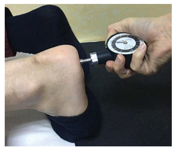
Figure 1. Use of a pressure algometer to measure pressure pain threshold in patients.