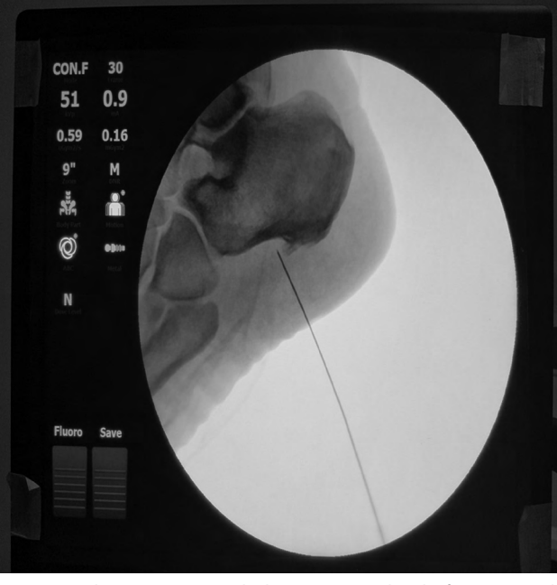
Figure 4. Fluoroscopic-guided conventional radiofrequency ablation: A 10 cm – long 22 G radiofrequency cannula with a 5 mm active tip's view around the calcaneal spur.

In this study, pre-treatment descriptive statistics were expressed as the mean and standard deviation for continuous variables and frequencies and percentages for categorical variables. The change in VAS score, PPT, and foot activity index overtime was evaluated using the Friedman test. The Dunn test was used to compare the groups to see from which measurement the difference originated. The significance level was set as p<0.05. Spearman's Rho test was used to measure the strength of the relationship between the two variables. Correlation is significant at the Spearman's rho ( \rho )<0.05. The data analysis was performed using