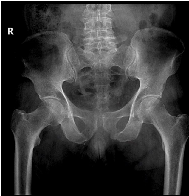
Figure 1. Anteroposterior radiograph of pelvis showing joint border irregularities and joint space widening.