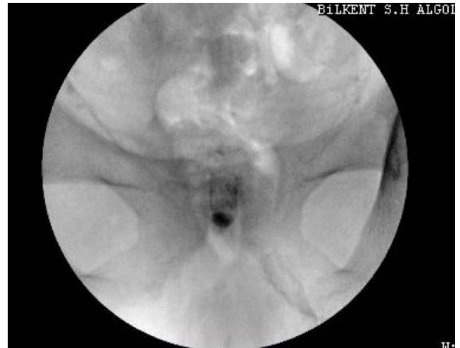
Figure 3. Contrast dye pattern at symphysis under fluoroscopy.

(Fig. 2). Complete blood count, sedimentation, C-RP, renal and liver function tests, urinary analysis, and culture were normal. After the diagnosis of OP, the patient underwent steroid injection treatment under fluoroscopic guidance. Using sterile techniques and a cutaneous local anesthetic injection with 3 cc lidocaine, a 22-gauge needle was inserted into the middle of the symphysis pubis under fluoroscopy. When we felt the sensation of reaching the disc, the needle was moved forward 1 cm away. Then, 1 cc non-ionic contrast was injected, and discal involvement of contrast was seen. So, 4 mg dexamethasone and 1 cc bupivacaine were injected (Fig. 3). For inner thigh pain and effusion between adductor muscles, we suggested ice and topical drugs because the pain was not severe. At one month, his pain had decreased significantly; the VAS score for pubic pain was 4. Inner thigh pain was absent. The range of motion was normal, and pubic symphysis tenderness was decreased. At three months, his pubic pain was better, and the VAS score was 3. Due to the improvement and the absence of severe pain that made daily living activities difficult, no further treatment was planned.