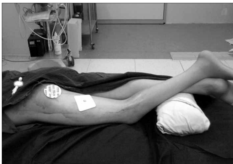
Fig. 1. “Figure of four” position and fixed catheter.

We reported a catheter placement for continue mid-femoral sciatic nerve block with US guidance at