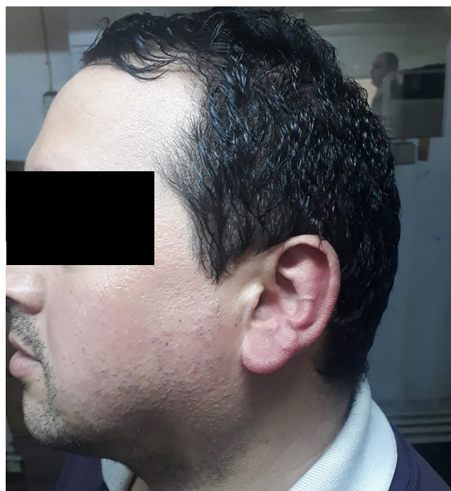
Figure 1. Redness on the face and left ear.

At the time of his admission to our clinic, he had complaints of burning sensation and redness on his face and left ear, nasal congestion, lacrimation, and rarely nausea (Fig. 1). He had no aura symptoms or photophobia, phonophobia, osmophobia, or ptosis. He reported a prolonged duration of episodes of severe headache for the last couple of years, reaching up to 7–8 h. The shortest duration of an episode was about 1 h and sometimes increased up to 12 h. The episodes of headache persisted for the whole year and became more severe in the winter season. According to the Numeric Rating Scale (NRS), the pain severity score was 4–5 in the summer and 9–10 in the winter season, indicating more severe pain. His medical history was unremarkable, except for type 1 diabetes. The patient previously underwent magnetic resonance imaging and magnetic resonance angiography for more than 10 times. These scans were retrospectively analyzed, and no abnormal findings were observed. Trigeminal somatosensory evoked potentials and eye-blink reflex responses were bilaterally symmetric and within normal ranges. Based on physi-