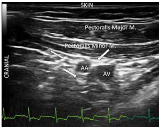
Fig. 1. Cords of the brachial plexus appear hyper-echoic. Arrows indicate lateral, posterior, and medial cords. AA: Axillary artery; AV: Axillary vein.