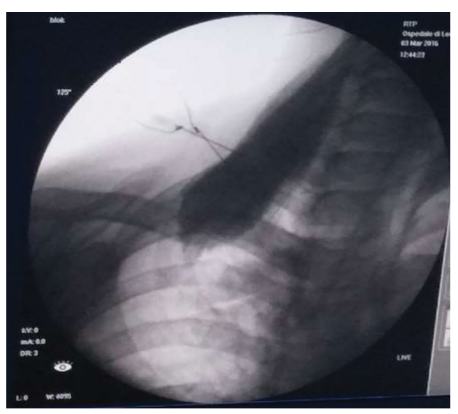
Figure 2. The mixture is restricted at the fracture line.