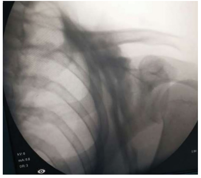
Figure 4. The mixture did not diffuse above the clavicular line and directed distally after the infraclavicular block.

found to have no pain after the skin incision. It was observed that the isolation of the supraclavicular nerve in the 15<sup>th</sup> min of the surgery and the addition of a local anesthetic relieved the patient of pain, and there was no requirement for additional medication. It was found that none of the patients had VAS scores higher than 1–2 in the first 24 h and none required additional analgesics.