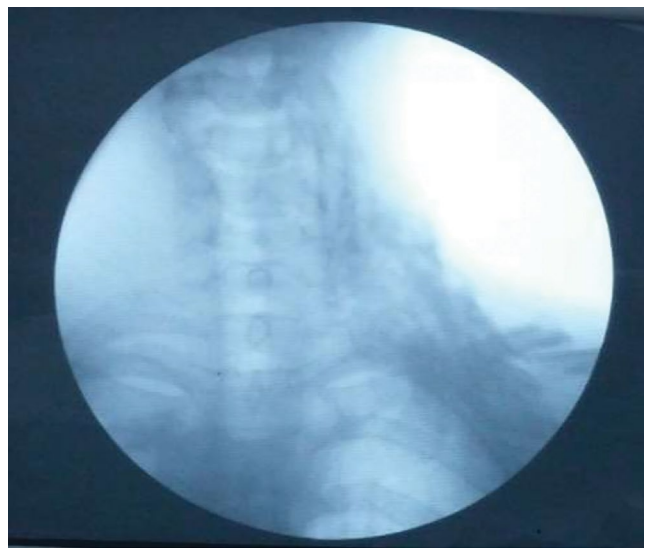
Figure 3. The mixture diffused below the clavicular line after the interscalene block.