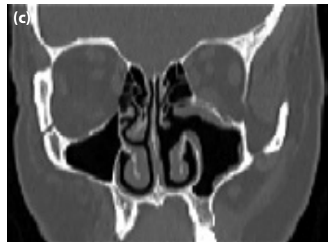
Figure 3. Case 3. (a) Preoperative CT section. (b) Introperative view. Removed fungus material. (c) Postoperative coronal CT.

secretion is cleaned (Fig. 3). At the histopathologic examination, fungus hyphae were observed and reported as aspergilloma. Bad smell sensation and facial pain complaints were improved but postnasal drip persisted at the 6<sup>th</sup> month follow-up.