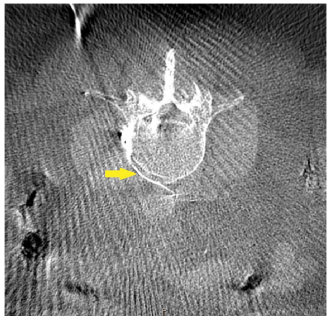
Figure 4. Cone beam CT reconstruction image and vascular escape image during TAESI operation of one of the participating patients.