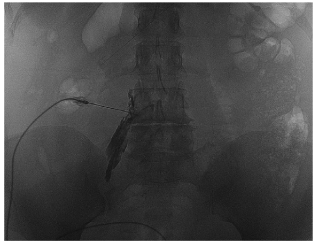
Figure 2. Anterior-posteriorfluoroscopy imageof one of the participating patients during TAESI procedure.

It was noted in 1998<sup>[7]</sup> that lumbar transforaminal epidural steroid injections administered with fluoroscopy were very effective on pain and it continues to be used as widely as every day. 3DCT angiography device is now an advanced device that provides detailed information about the diagnosis of many diseases and the progression of the disease. Early identification and follow-up of brain-related problems,<sup>[8]</sup> as well as cardiac problems<sup>[9]</sup> and many other system problems, enable us to visualize vessel and lymphatic structures in 3D. In the literature, it is guite surprising that the lumbar TAESI application is very rarely performed with this device providing such detailed information. Therefore, the results of our study are very important in terms of whether the firstly fluoroscopic TAESI goes to the right target, or where it spreads, and simultaneously presents the recorded data with 3DCT angiography device.