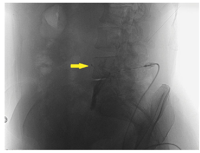
Figure 3. Rotational angiography oblique image of one of the participating patients during TAESI procedure.