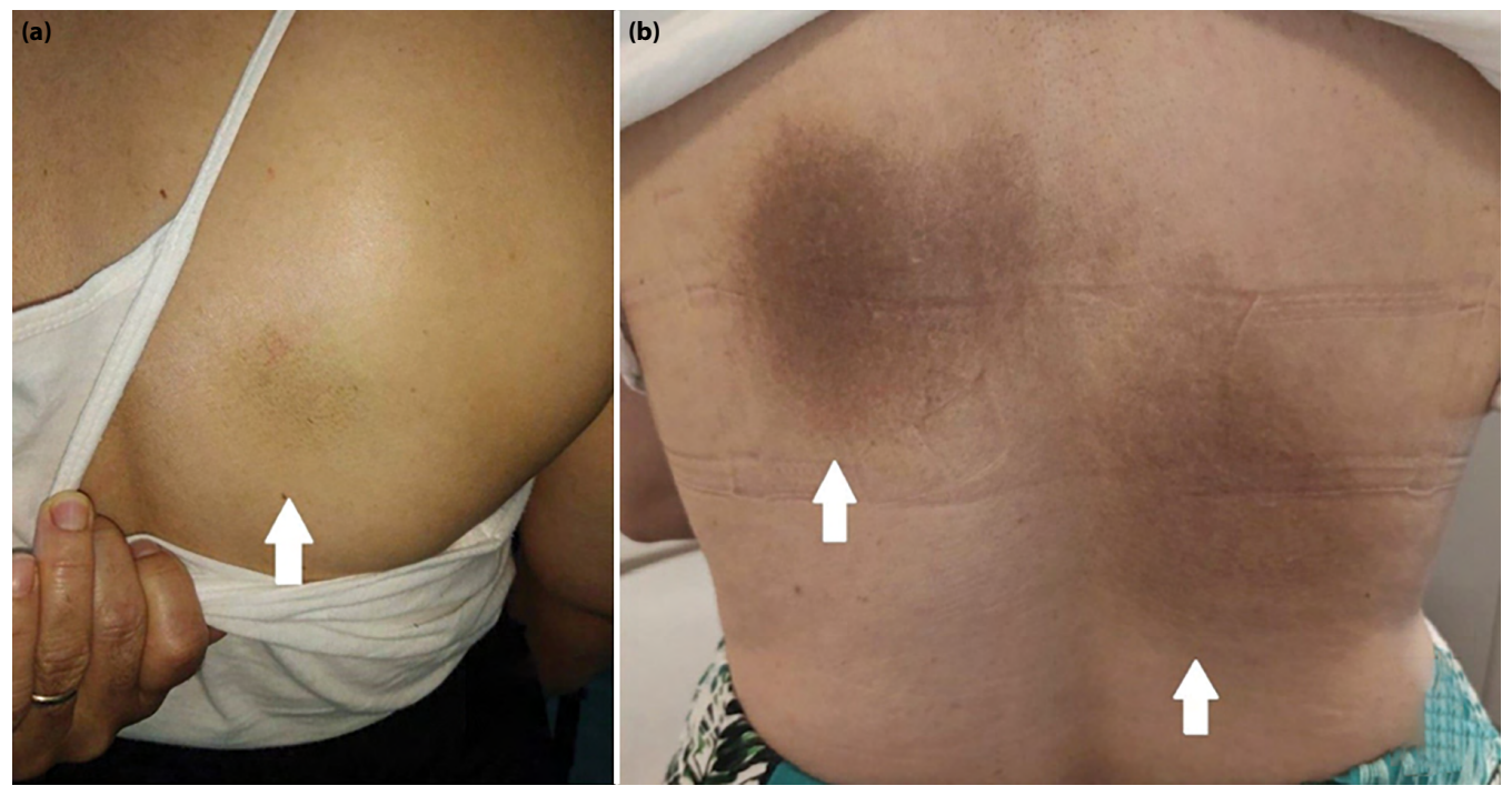
Figure 1. (a) Unilateral 2x3 cm hyperpigmented brownish patch in the scapular area in 42 years old female patient (b) Bilateral hyperpigmentation in the back area in 49 years old female patient.

tients completed the questionnaire before and after treatment. The total score was calculated as the sum of ten items, and the cut-off value for the diagnosis of neuropathic pain was a score of 4 or greater.