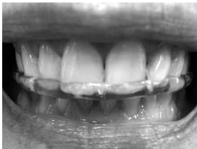
Figure 1. Stabilization splint constructed from hard acrylic.

Group 2: These patients were treated with TrPs injection in combination with SS therapy. TrP injections were applied into the affected masseter (22