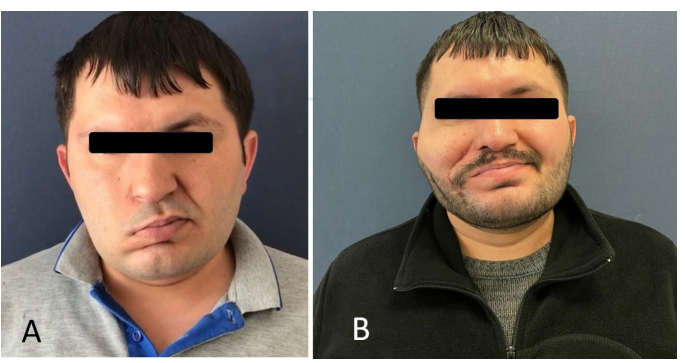
Figure 3: Case 6 a) Preoperative photo of the Case 6. b) 13 months After functional gracilis muscle transfer, gracilis muscle bulk can be seen at cheek level.

Based on our observations and surgical outcomes, we formulated an algorithm to address traumatic facial nerve injuries, as shown in Figure 3. This algorithm encapsulates the decision-making process and serves as a guide for potential therapeutic interventions in traumatic facial nerve injuries.