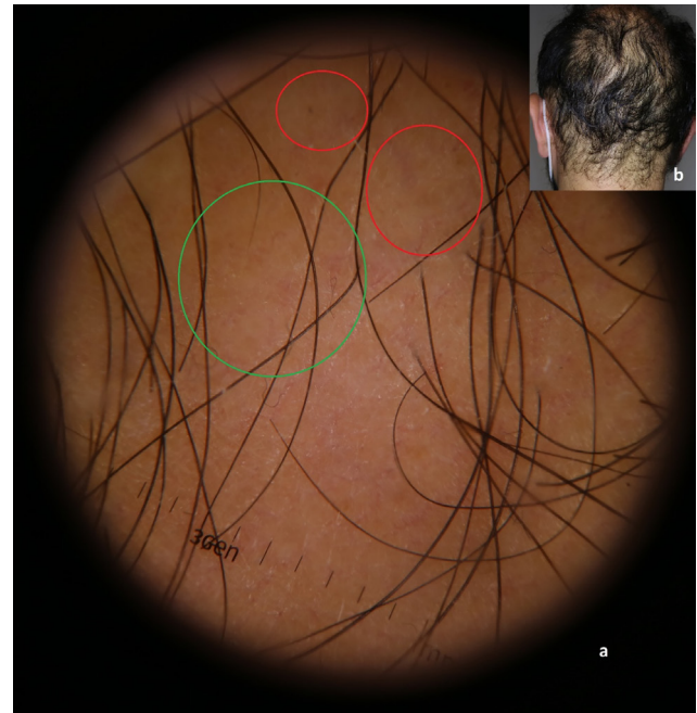
Figure 2. (a) Loss of follicle ostia (green circle), erythematous background (red circle) on trichoscopy; (b) Diffuse thinning of hair on the scalp and multiple alopecic patches

provides valuable insight into the diagnostic challenges of AA, it is not without limitations. The limitations of our study are that the study was conducted with a small group in a single country and that information about various skin types and colors was not obtained. Multicenter studies are needed to confirm our findings.