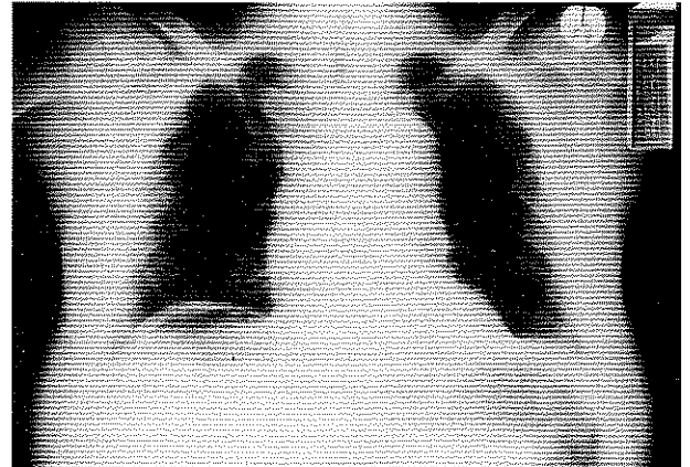
Figure 1. A posteroanterior chest film showing air between right hemidiaphragm and liver, and metastatic coin lesion.

Depts. of Surgery and Emergency Medicine Dokuz Eylül University, School of Medicine, Correspondence and reprints address: Selman SÖKMEN, M.D. 651 Sok. No. 8/3 Gazemir, Izmir 35410, Turkey