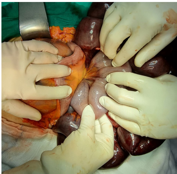
Figure 3. Necrotic small bowel loops.

el loops were reduced by manual traction. Necrotic, small bowel loops were resected. An end-to-end anastomosis was performed between the proximal portion of the jejunum approximately 100 cm distal to the ligament of Treitz, and the distal portion of the ileum approximately 40 cm distal to the terminal ileum. The defect was primarily repaired, and the operation was terminated. The post-operative period of the patient was uneventful, and he was discharged on the post-operative 10th day. It was considered to be extensive ischemic necrosis during the histopathological investigation. He had no complaints during the 8th-month post-operative follow-up, and his physical examination was evaluated to be within normal limits.