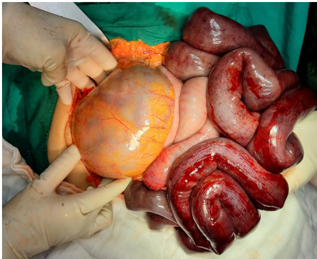
Figure 2. Most of the small bowel loops encapsulated within the hernia sac.