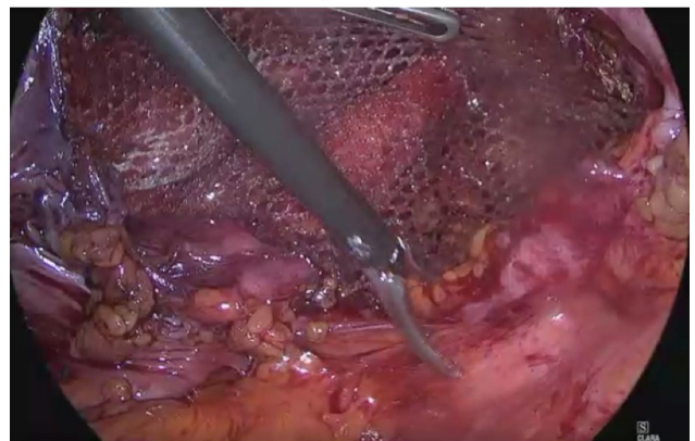
Figure 3. Hernia repair with mesh.