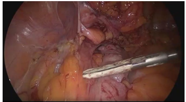
Figure 1. Laparoscopic resection of strangulated segment.

Of the five female patients operated on for femoral hernia, three had ischemia with a clear demarcation in the incarcerated intestinal segment. Laparoscopic resection and anastomosis