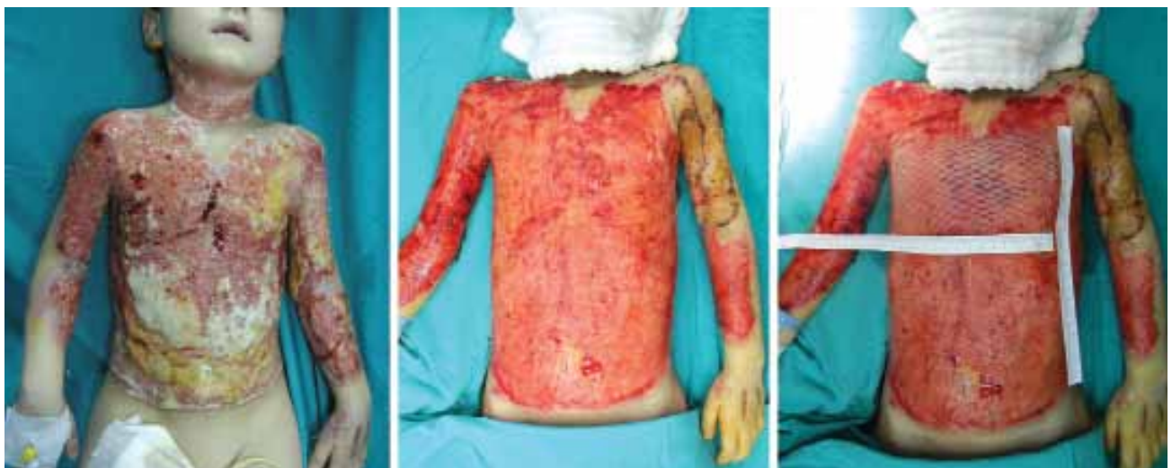
Figure 2. Preoperative appearance of the patient (left); after tangential excision of the necrotic and eschar tissue (middle), autografts were placed on the burn wound area.