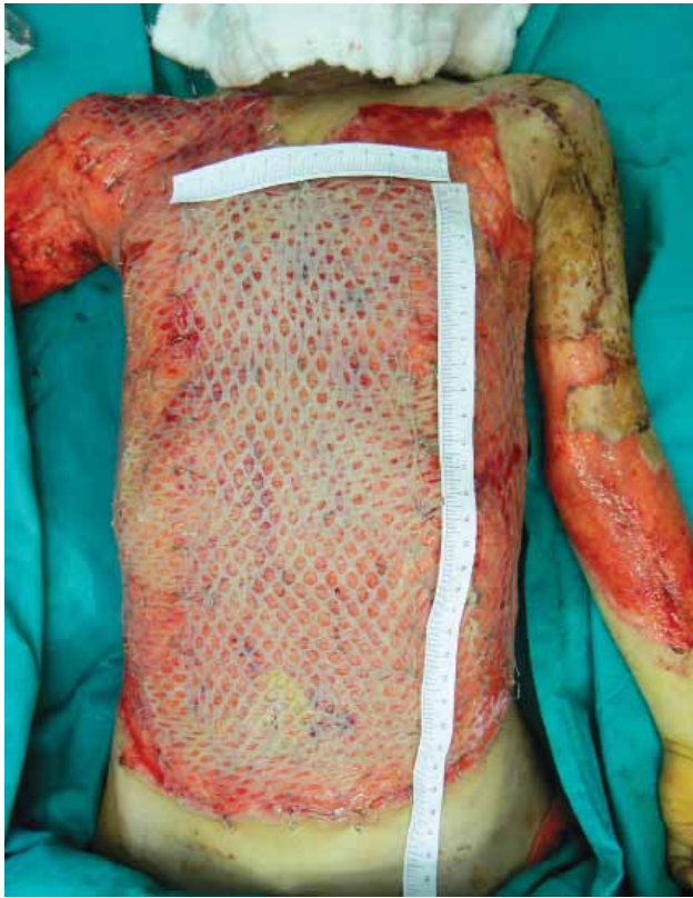
Figure 3. Allografts were placed over the autograft in the same manner.

graft area was measured and recorded as an expanded autograft area. Allografts were placed over the autograft in the same manner, and the meshed allograft area was measured and recorded as an expanded allograft area (Fig. 3). Auto-allografts were covered with Bactigras®, and the first dressing change was made on the postoperative 3rd day. After the first dressing change, graft care was performed on a daily basis to monitor autograft take and allograft rejection.