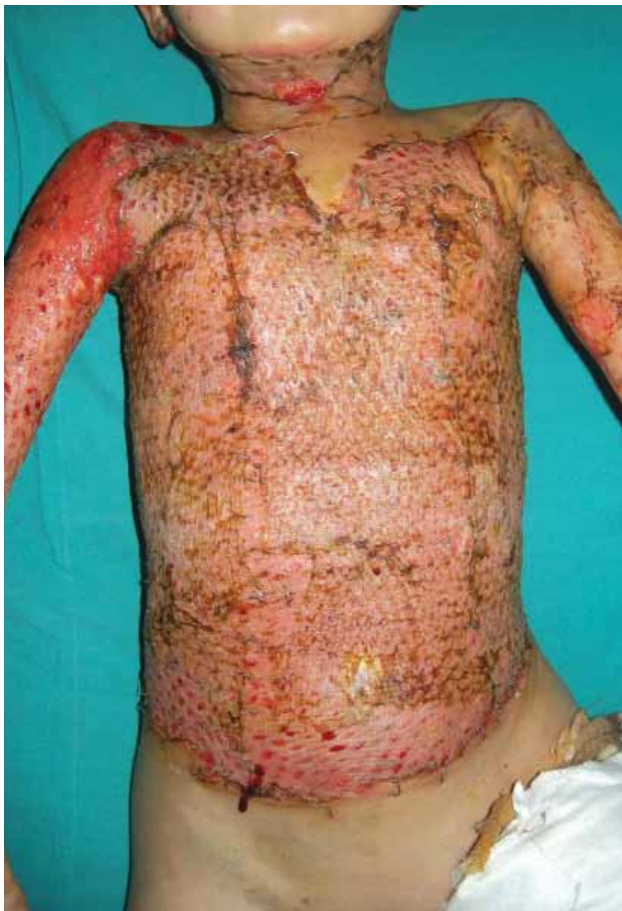
Figure 5. 84% flame+inhalation burn. The patient died on the post-burn 34th day with intact auto-allograft (appearance of the auto-allografts on the postoperative 10th day).

sults. However, we believe that both our results and their results are subjective because of non-standardized stretching of the graft. With a standardized stretching method, more predictable results could be obtained.