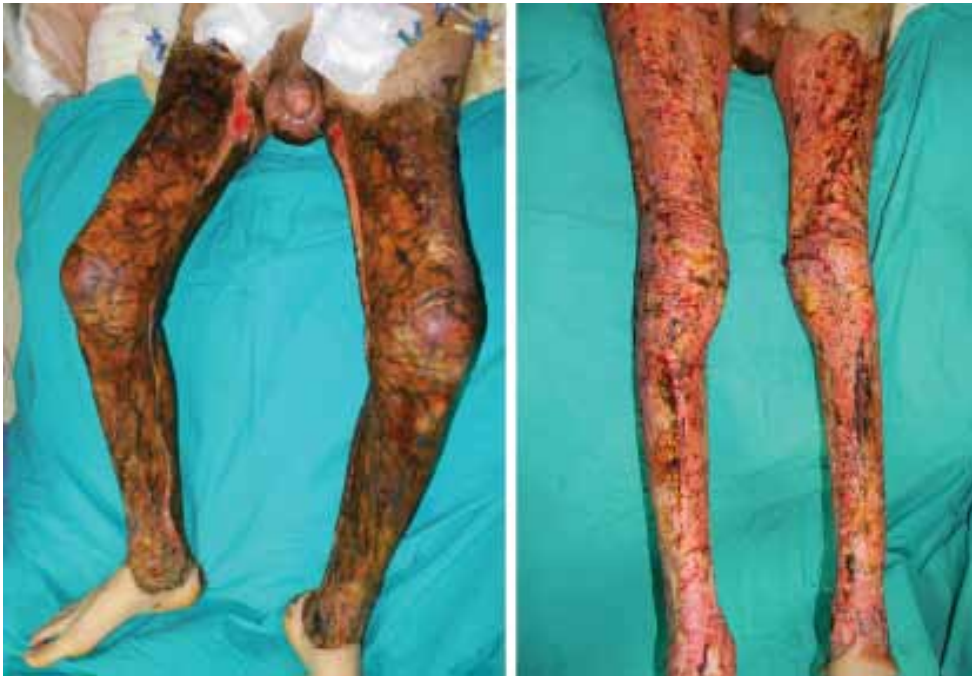
Figure 4. Appearance of the patient on the postoperative 8th day. The epithelialization between graft bridges was achieved.