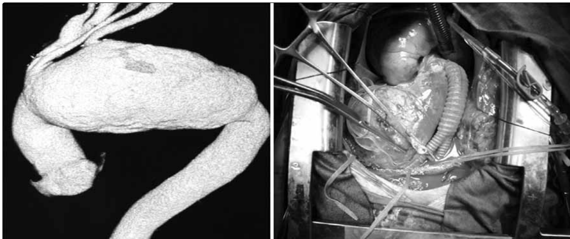
Fig. 2. Preoperative and intraoperative images of Patient 5. After surgical rebranching, endovascular stent graft was placed into the arcus and descending aorta.

Routine follow-up at the sixth month with CTA did not reveal any endoleaks. Aneurysmatic sacs were thrombosed. We did not observe aortic diameter increase in any of the patients. No ischemia was seen in the upper and lower extremities. Patients' symptoms disappeared 15 days after the intervention on average.