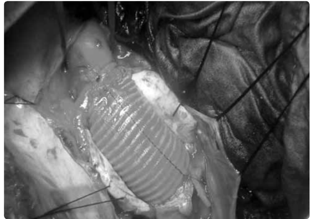
Fig. 4. Patient 2 after interpositioning of the Dacron graft to the descending aorta via left thoracotomy.

Traumatic thoracic aortic injuries are usually located distal to the left subclavian artery. [5] Intercostal arteries, pleura and the ligamentum arteriosum fix the descending aorta more rigidly than the aortic arch and the heart during its course through the vertebral sulcus. During a horizontal deceleration trauma, the descending and other parts of the aorta move at different speeds. As a result, the isthmic part of the aorta is under maximum stress, and thus may yield total or partial rupture of the vessel. Direct loading of the pressurized descending thoracic aorta causes isthmus injury secondary to aortic wall strain. Deep medial lesions are common and could propagate soon after injury to form pseudoaneurysms. [6] Among the patients presented to our clinic, all but one had aneurysms distal to the subclavian artery (87.5%) and 75% were saccular. The interval between the trauma and diagnosis used in the literature to differentiate acute and chronic traumatic aortic injuries is not clear, varying between 36 hours and 3 months. [7,8] The interval between the trauma and diagnosis of a pseudoaneurysm may change. In a group of 10 patients operated for traumatic thoracic aortic aneurysms, Buket et al. [9] reported this period to