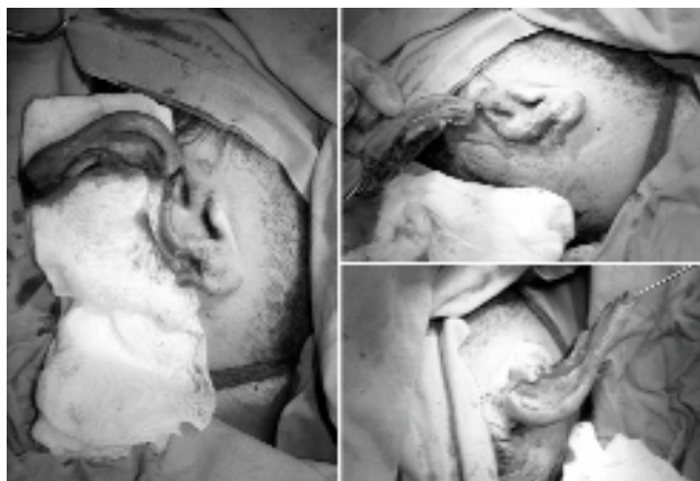
Fig. 1. Preoperative views of a subtotally amputated right ear. Only a strip of skin 6-mm wide connected the helical rim to the temporal region. Posterior skin and cartilage of the helix and antihelix were completely amputated. Good tissue perfusion and bleeding from the wound edges can be seen.

Operation was performed under general anesthesia, about three hours after the injury. First, the wound margin was debrided for about 2 mm on the auricular and temporal sides until favorable normal bleeding was confirmed, except for the remaining skin attachment. The cartilage and skin were sutured in layers. The ear was reattached without using microsurgical techniques. A bandage with slight compression was used. No signs of edema, venous congestion or arterial insufficiency were observed immediately after the operation or subsequently. Postoperatively, we administrated dextran 40 for 5 days to improve the microcirculation and increase