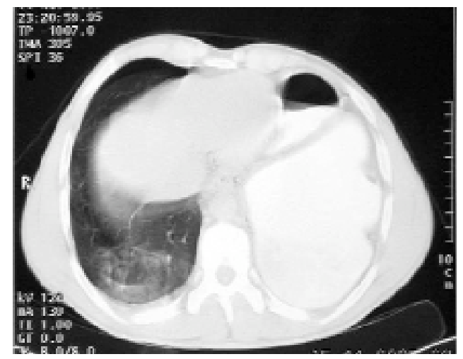
Fig. 2. Computerized tomography revealed that the stomach and spleen had moved to the left hemithorax.

Diaphragmatic ruptures often occur after severe blunt traumas. In less than 1% of the cases, there is either no apparent cause or there are various precipitating factors elevating the intra-abdominal pressure. There are cases of DRs reported to have occurred after heavy coughing, delivery, vomiting, heavy weight lifting, strenuous efforts and barotraumas.<sup>[1-5]</sup> It is not clear in those cases, however,