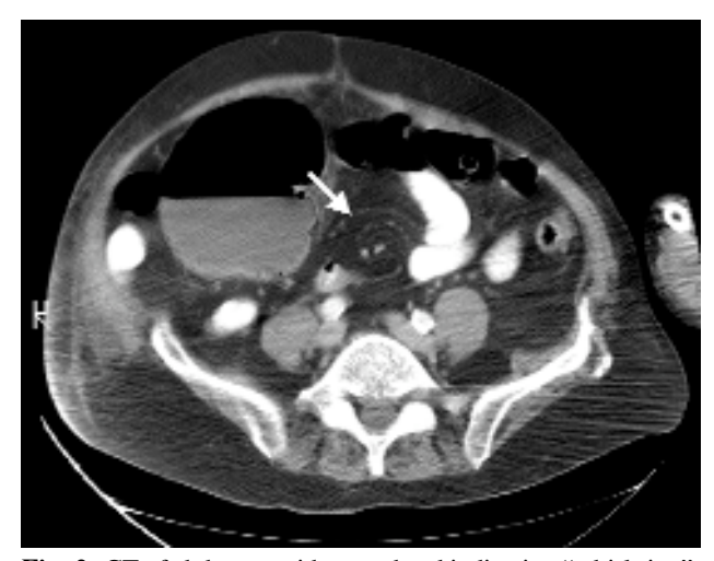
Fig. 2. CT of abdomen with arrowhead indicating "whirl sign".

the mesentery of the cecum and right colon with the posterior parietal peritoneum. [4,5,8,11,12] In normal in utero development, the gut rotates about the distal ileum before returning to the abdomen and undergoing fusion of the ascending mesocolon to the right gutter. Based on cadeveric studies this fusion appears to be absent in 11.2% of autopsy examina-