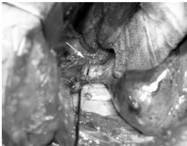
Fig. 2. Bronchial anastomosis were made with absorbable suture material. (7th patient)

The 12th case was diagnosed as having blunt thorax trauma in the left side and abdominal trauma because of traffic accident in another medical center and was operated for primary suturing of the liver