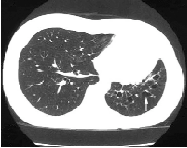
Fig. 3. CT scan of the 1st patient five years later (left lower lobe bronchiectasia).

patients, Bertelsen et al. [4] reported only 33 patients with TBI and they described that 27 of these patients died immediately. Although most of the cases present a dramatic life threatening clinic course, some cases may run a much more benign course with minimal symptoms. [5] In our series the 1st, 5th and 12th cases were admitted to the emergency room in critical conditions; the remaining cases were generally in a better condition on admission.