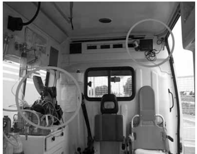
Fig. 2. Emergency vehicle cabin after installation of the electronic devices.

These vehicles were also staffed with specially trained crews. It should be mentioned that during the study, the ambulance drivers always drove in accordance with the traffic regulations and respected to the letter the speed limits both within and without the city boundaries.