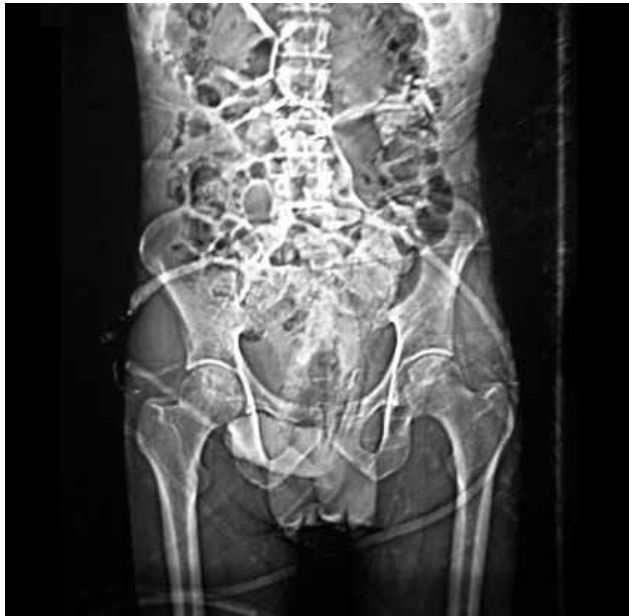
Fig. 1. Plain abdominal radiograph showing the dilated bowel loops and foreign body in the rectum.

tum two weeks before. A plain abdominal radiograph (Fig. 1) and abdominal computerized tomography (CT) scan (Fig. 2a, b) showed the bull horn impacted in the rectosigmoid region with proximally dilated bowel loops. There were no signs of perforation.