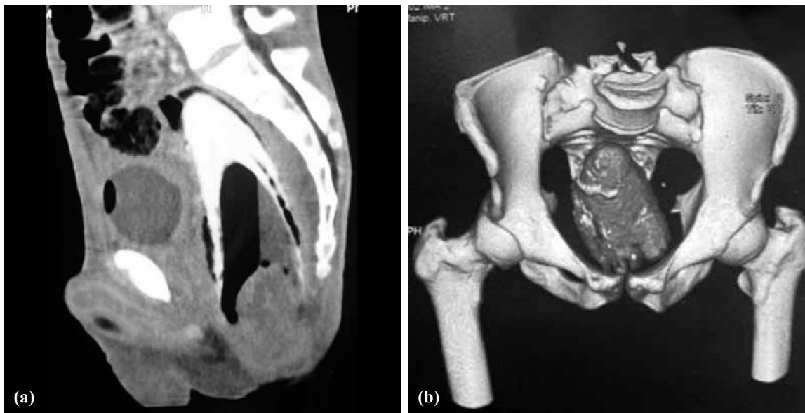
Fig. 2. (a) Sagittal view of the CT scan showing the high-impacted bull horn in the rectum. (b) 3-D reconstruction showing the rectal foreign body in situ.

A cattle horn as the rectal foreign body is quite rare, and is probably the fourth such case. [1] Moreover, a rectal foreign body presenting further as bowel obstruction is an even rarer phenomenon. In this case, as the cattle horn was large and impacted high in the rectum, with a sharp serrated edge at the base (as clearly depicted by the CT scan), any manipulations through the transanal route could have caused rectal perforation or injury to the sphincter, with prolonged complications. Thus, an early decision for emergent laparotomy was taken and the horn was removed without incident.