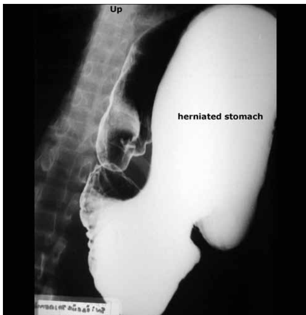
Fig. 2. A barium swallow demonstrating a large paraesophageal hernia with a gastric volvulus and gastric outlet obstruction.

volvulus with gastric outlet obstruction, and the greater curvature of the stomach was above the level of the lesser curvature, and the cardia and pylorus were positioned at about the same level (Fig. 2). The peritoneal cavity was explored through an upper midline abdominal incision. Exploration revealed the presence of a gastric volvulus herniating into the left chest cavity through an approximately 7x3 cm old diaphragmatic defect (Fig. 3). After meticulous dissection, the stomach was reduced into the abdominal cavity, and the diaphragmatic defect was repaired with 0 monofilament polypropylene sutures. The postoperative course was uneventful, and the patient was discharged from the hospital on the 5th postoperative day. In the follow-