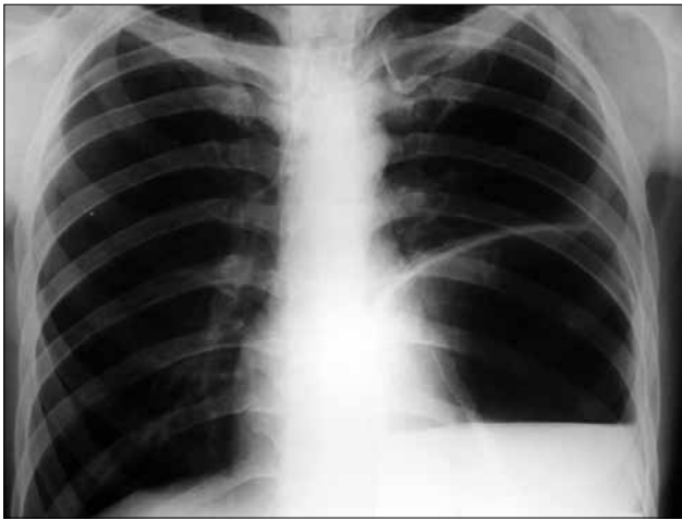
Fig. 1. Chest radiography showing a dilated gastric shadow with a fluid level.

volvulus with gastric outlet obstruction, and the greater curvature of the stomach was above the level of the lesser curvature, and the cardia and pylorus were positioned at about the same level (Fig. 2). The peritoneal cavity was explored through an upper midline abdominal incision. Exploration revealed the presence of a gastric volvulus herniating into the left chest cavity through an approximately 7x3 cm old diaphragmatic defect (Fig. 3). After meticulous dissection, the stomach was reduced into the abdominal cavity, and the diaphragmatic defect was repaired with 0 monofilament polypropylene sutures. The postoperative course was uneventful, and the patient was discharged from the hospital on the 5th postoperative day. In the follow-