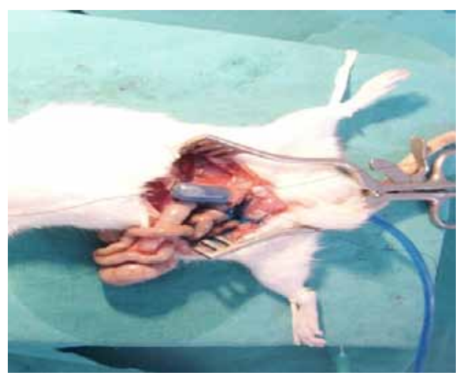
Fig. 2. Bursting pressure measurement.