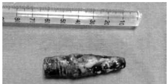
Figure 4. Nasal foreign body after removal (plastic pen cap).