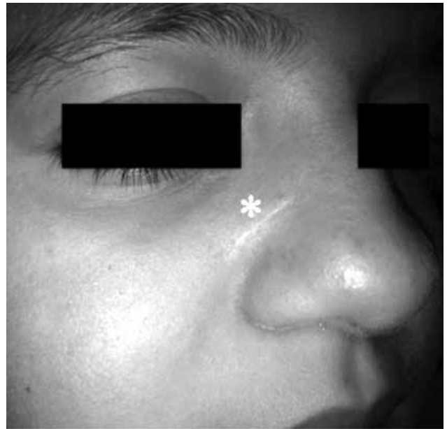
Figure 2. Traumatic scar on the right nasolabial sulcus (asterisk).

are familiar with the removal techniques, multiple attempts may be required for removal, [8] and their failure rate can be as high as 35%. [9] Some FBs are inert and may remain in the nose for years, but others can harm the nasal mucosa, leading to mucosal ulcerations, epistaxis and toxemia in some cases. Longstanding FBs in the nose also tend to become encrusted with calcified material and become a rhinolith. [3] There are some cases in which the FB remained in the nasal cavity up to 40 years. [10] These can cause nasomaxillary abnormalities in the growing child.