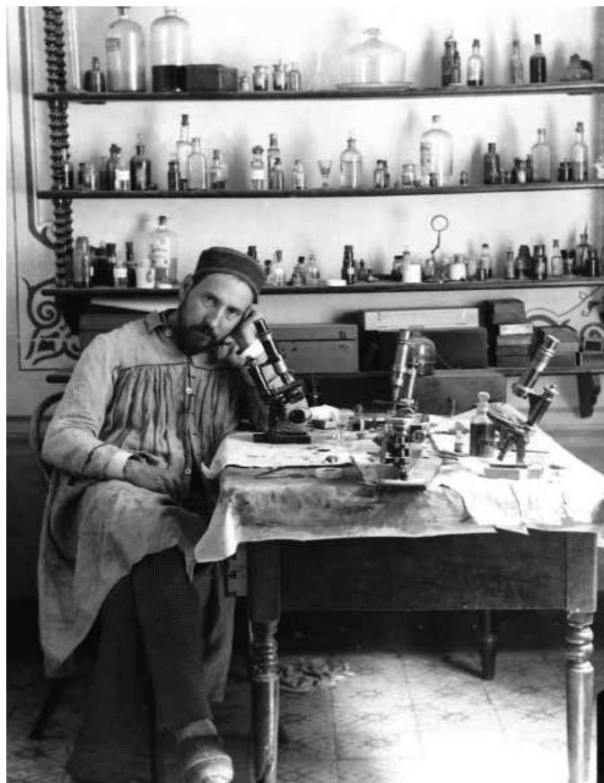
Figure 2. Santiago Ramon y Cajal. Valencia University, 1885 (17)

Cajal improved the Golgi method by double precipitation and chose the right structures to evaluate, which enabled him to see details that could not be seen by other researchers using the same