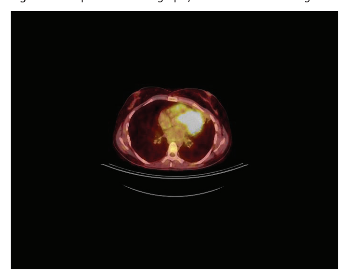
Figure 2. Positron emission tomography scan after treatment.