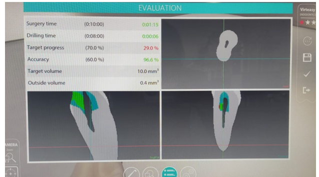
Fig. 2. Parameters obtained from haptic virtual reality simulator.

according to the output data received from the software to ensure standardization and avoid any bias.