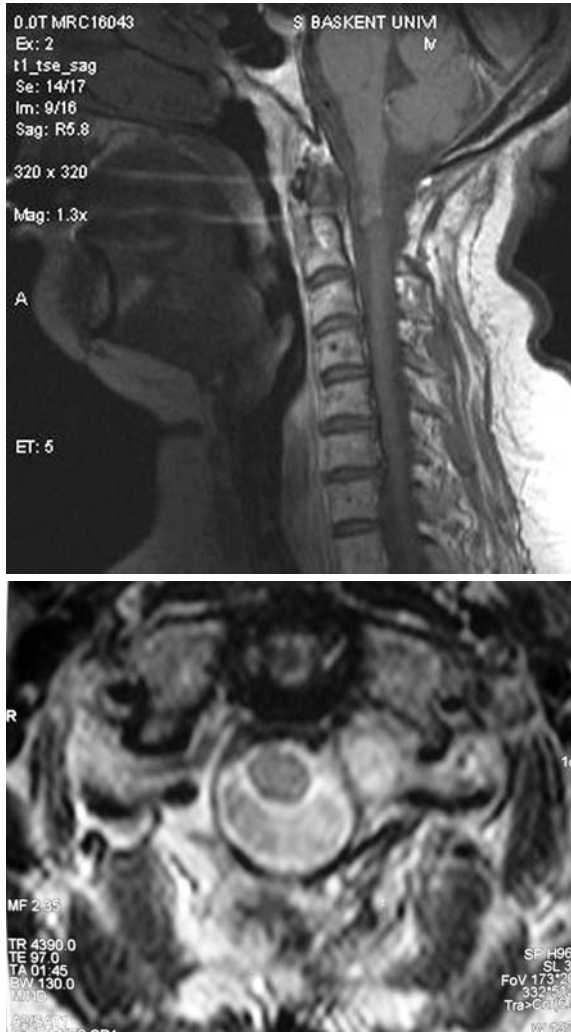
Figure 2. Sagittal (A) and axial (B) T2-weighted MR images of the cervical spine of the patient taken 2 months after the operation clearly show that the intradural component of the tumor at the level of C1-C2 was excised and there was no spinal cord compression.