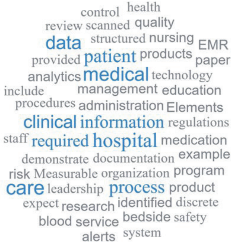
Figure 3. Most common keywords - Cloud of words

In this analysis, the most frequently used 30 words and their frequencies were extracted from all the guides (Table 1). The analysis demonstrated that the similarity of the keywords (as unigrams) used in all guides was approximately 33.3%. A word cloud was created for the similarly used keywords (in blue colour) and dissimilar keywords (in grey colour) in the two guides (Figure 3).