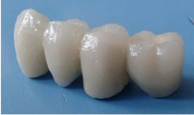
Figure 4: Retrieved aspirated metal ceramic bridge