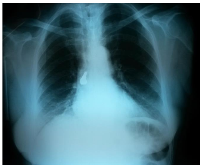
Figure 1: Chest radiograph showing metal ceramic bridge (4-unit crowns) lodged in the right mainstream bronchus (anteroposterior view of X-ray)

Auscultation differences between respiration of both lungs and ABG analysis indicate radiographic imaging of the lung under suspicion for acute obstruction of respiratory tract. After chest radiography, the radiologist described MFB in the right bronchus and soft transparency difference between the left and right lung (Figure 1).