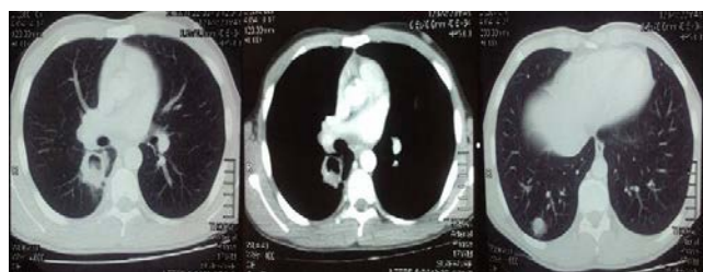
Figure 2. Chest CT scan showing cavitory lesions containing air and infiltration in the apical segment of right lower lobe and a nodular lesion in the posterobasal segment of the right lower lobe

CT of the thorax revealed a cavitory lesion containing air and infiltration in the apical segment of right lower lobe and a nodular lesion (2 cm in diameter) in the posterobasal segment of the right lower lobe (Figure 2). Abdominal ultrasonography was normal.