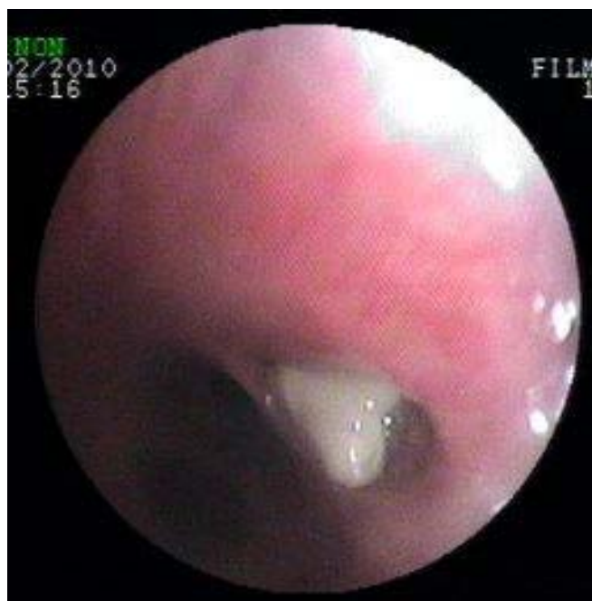
Figure 3. Bronchoscopic appearance showing a whitish membranous material in the apical segment of the right lower bronchus