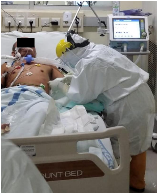
Figure 2: Operator's personal protective equipment: N95, full eye protection, face shield, gloves and fluid-resistant gown

Even though current evidence fails to observe SARS-COV2 aerosolization through the inserted chest tube, there is a potential contamination risk through a chest drain air leak. It is reasonable, therefore, to perform a thoracostomy in a negative pressure airborne infection isolation room (AIIR). When no AIIR is available, entering the room within 10 minutes of the procedure should be avoided (11). The prevention of transmission is achievable through adequate room preparation, the minimization of the assigned personnel and the use of personal protective equipment (at minimum, an N95 mask, full eye protection, face shield and a fluid-resistant gown). A suction wall and a virus filter may minimize chest drain-mediated droplet exposure (12,13).