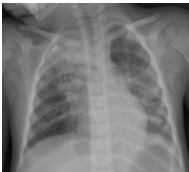
Figure 4: The subcutaneous emphysema was found to have completely resolved a chest X-ray on postoperative day 4

Non-traumatic pneumomediastinum is rare in children, and should be investigated cautiously for foreign body aspiration when seen in patients under 3 years of age. An initial fasciotomy should be carried out to decrease mediastinal pressure in patients with a poor general condition, severe dyspnea and pneumomediastinum, followed by a rigid bronchoscopy.