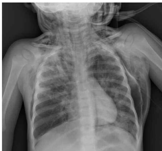
Figure 1: A chest X-ray revealed accumulated air in the upper mediastinum around the heart and the soft tissues of the neck