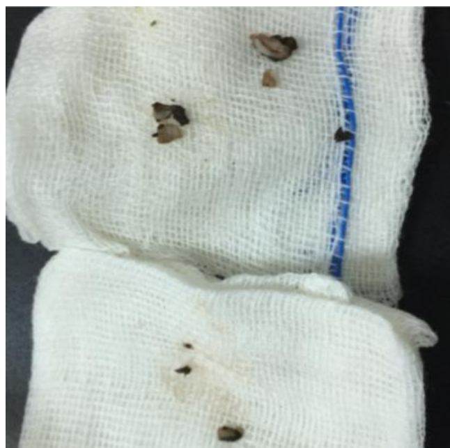
Figure 3: Foreign Bodies

Pneumomediastinum develops when air diffuses from the tracheobronchial tree into the mediastinum via the interstitial and perivascular space, and subcutaneous emphysema subsequently occurs with the diffusion of air into the subcutaneous tissue (6). The incidence of pneumomediastinum secondary to foreign body aspiration is 1.5%. The clinical picture of pneumomediastinum can vary, ranging from chest pain to subcutaneous emphysema, dyspnea, hemodynamic instability and death. The severity of the clinical picture can be determined from the degree of dyspnea (7). Pneumothorax concurrent with pneumomediastinum may also be seen in foreign body aspirations. The mechanism behind the development of pneumothorax can take two forms. First, a foreign body ob-