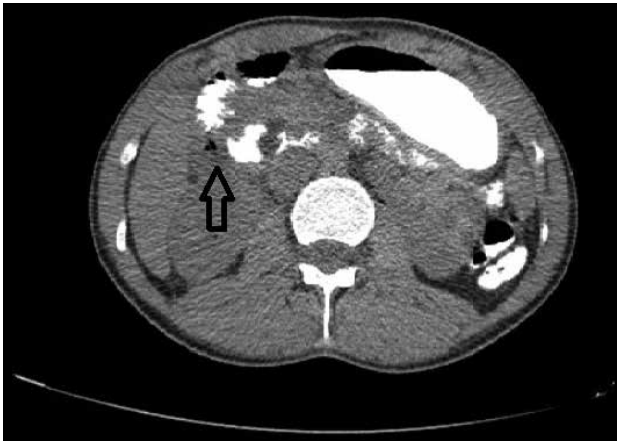
FIGURE 1. Duodenal diverticulum and free air in its vicinity.

abdominal ultrasound without intraabdominal free fluid. The patient underwent oral/intravenous contrast-enhanced computed tomography (CT) and at the junction of 2., and 3. parts of the duodenum, a 3.5 cm –long diverticulum filled with oral contrast material and free air in its vicinity were detected (Figure 1). The patient was urgently operated with the diagnosis of perforated duodenal diverticulum. Surgical exploration revealed the presence of periduodenal phlegmon. Following liberation of the duodenum using Kocher manoeuvre, perforated duodenal diverticulum was detected at the junction of the second and third part of the duodenum (Figure 2 A). Diverticulum was nearly 4 cm in length and diverticulectomy was performed using GIA linear cutting stapler (GIATM Stapler, Covidien, Mansfield, MA, USA) (Figure 2 B). The patient was discharged without any postoperative problem and complaint.