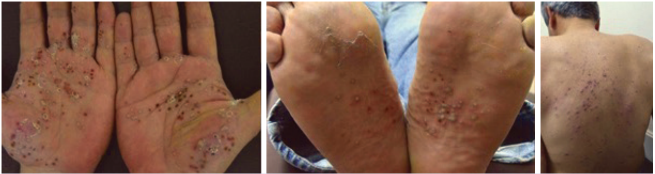
FIGURE 1. Multiple pustular lesions on the palmoplantar areas and back.

dermatological examination, multiple erythematous pustules and papules were observed on the both palmar and plantar regions, trunk, and back (Figures 1–3). There was no bacterial growth on the culture media taken from the pustular lesion.