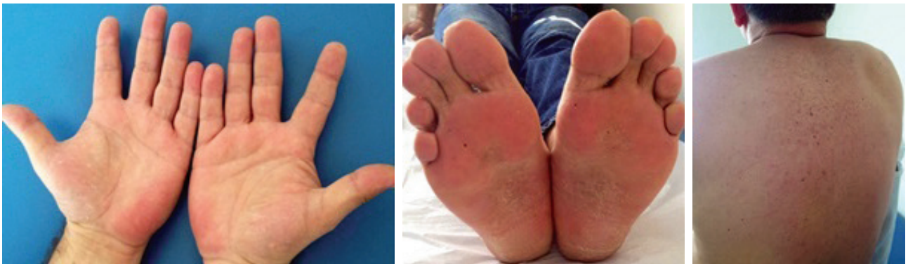
FIGURE 2. Improvement in the skin lesions after the treatment.

Etanercept has systemic adverse effects involving