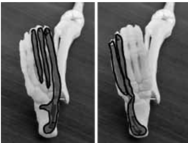
FIGURE 5. Weight- shifting pattern. During normal walking weight-bearing pattern passing through lateral edge of the foot, shifts to the medial side, and medial structures rest on the floor.

When the foot is in supination, bones of the midfoot are locked, and lose much of their capacity to move. However joints of the pronated foot become more mobile. During weight-bearing, eversion of the heel, and abduction of the forefoot cause collapse of the midfoot, shortening of the longitudinal arch, and consequently talar head, and navicular tuberosity rest on the floor, and bears the whole weight. With time Achilles tendon shortens, and everts the foot with potential worsening of the deformity, and development of tendon contracture. Many techniques have been used to identify, and define medial longitudinal arch of the foot including radiological imaging modalities, podoscopic systems which employ mirror to show the contact area beneath the foot, whole toeless footprint analysis, arch height, and foot plantar pressure measurements. To obtain quantitative data, Clarke angle, Chippaux-Smirak Index (CSI), Staheli arch index have been defined. Among them CSI [10, 11] has been reported to have a predictive value above 90 percent [12]. CSI is the ratio between the widest (segment a) and the narrowest (segment b) areas with borders passing through metatarsal heads as estimated from podographic measurements of footprints. The classification of feet based on b/a ratio