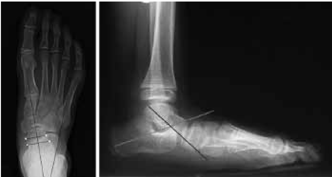
FIGURE 7. Anterior and lateral talocalcaneal angle. On anteroposterior radiograms the angle between the longitudinal axes of the talar, and anterior talocalcaneal joints (Kite angle). It normally measures between 15, and 35 degrees which decreases in varus foot, and increases in hindfoot valgus. On lateral radiograms the angle between longitudinal axes of talus, and calcaneus (plantar surface axis of the calcaneus) is termed as lateral talocalcaneal angle.