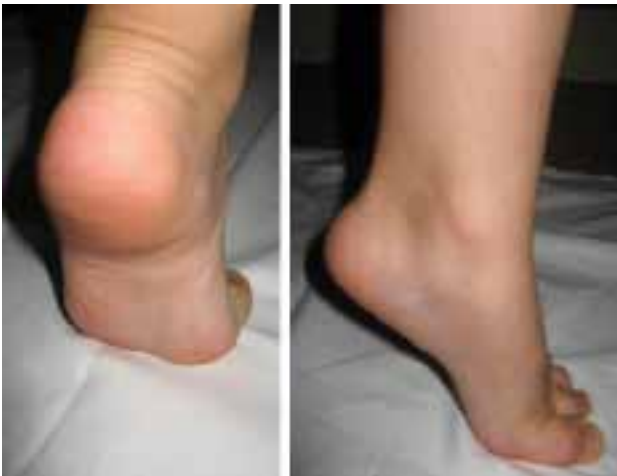
FIGURE 2. Tiptoe test. While raising up on tiptoe, reconstruction of the medial longitudinal arch collapsed during weight-bearing is observed.