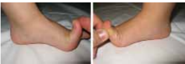
FIGURE 3. Dorsiflexion of the great toe test. When great toe is brought to passive dorsiflexion position, emergence of medial longitudinal arch is observed.

prevalently in children, and occasionally in adults". In their study, Wenger et al.[4] concluded that "flexible flatfoot is an unavoidable outcome of trying to walk on normal foot bones with loose ligaments." Apparently, most of the time flatfoot does not cause any problem.