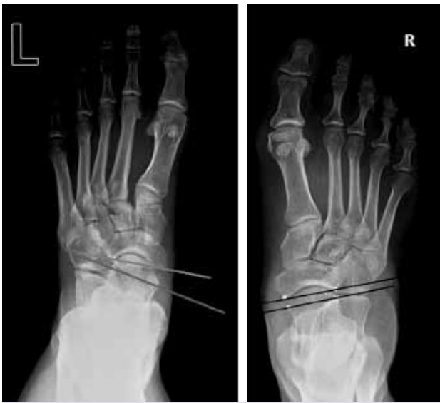
FIGURE 9. Normal, and deformed talonavicular grasping angle. On dorsolateral radiographs obtained while the patient is standing on foot, the angle formed by the bisection of the antero-medial, and the anterior-lateral extremes of the talar head, and the bisection of the proximal articular surface of the navicular. If it is more than 7 degrees, then it indicates presence of a lateral talar subluxation.

exceed 7 degrees (Figure 9). On lateral radiographs of the patients standing on feet with shorter medial longitudinal arches, talus assumes a more vertical, while calcaneus, and metatarses take a more horizontal position. In cases requiring further examinations, on oblique radiographs or Harris radiographs (radiographs of the posterior aspect of the foot obtained from a 45° angle of projection) tarsal coalition, vertical talus, talipes calcaneovalgus, accessory navicular bone can be visualized.