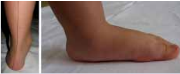
FIGURE 1. Collapse of the weight-bearing foot. During weight-bearing, disappearance of the medial longitudinal arch of the foot is seen. On posterior view, angling of the Achilles tendon (hindfoot valgus) is observed.