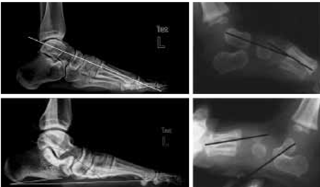
FIGURE 8. Normal, and deformed Meary angle. Lateral radiograms obtained while the patient is standing on foot, the angle between longitudinal axes between the talus, and the first metatars is called Meary angle. Normally these two axes are in alignment.

calcaneal angle should range between 15°, and 35°. An angle over 35° indicates hindfoot valgus. On lateral radiograms, talocalcaneal angle should vary